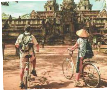
Angkor temple, Cambodia