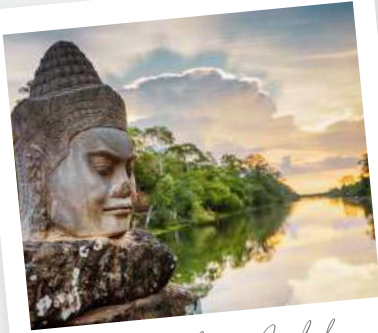
Stone face Asura, Cambodia