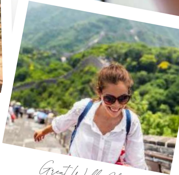
Great Wall, China