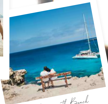
Relaxing on the Beach