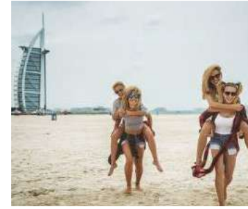
Summer Fun in Dubai